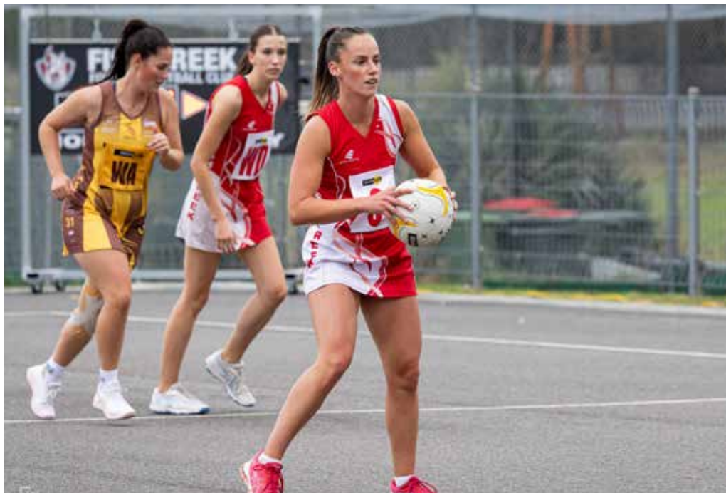
Action from the Fish Creek V's Morwell East games.